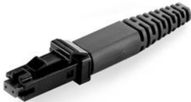
MT-RJ Female Connector Standard